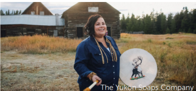
The Yukon Soaps Company

We have identified five priority areas as having the greatest potential for impact using innovation; maternal, newborn & child health; early childhood development; safe pregnancy termination; global mental health; and sanitation.